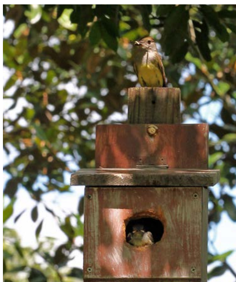
Great-crested Flycatchers in and on nest box.

These flycatchers nest in the cavities of dead trees, abandoned woodpecker holes, hollow posts, even buckets, pipes, cans and boxes. Last spring one checked out a four-inch