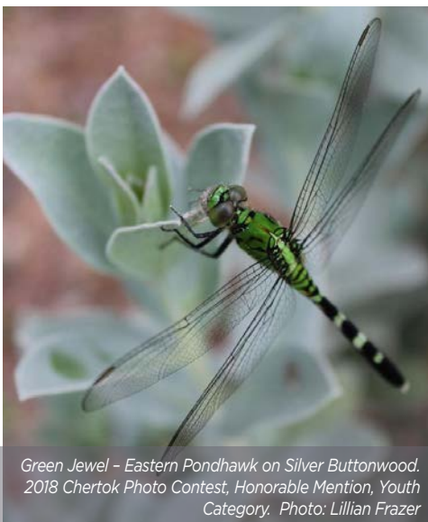
Green Jewel - Eastern Pondhawk on Silver Buttonwood. 2018 Chertok Photo Contest, Honorable Mention, Youth Category.