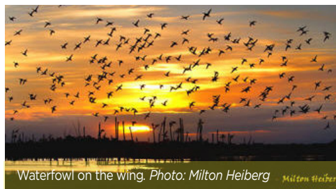
Waterfowl on the wing.