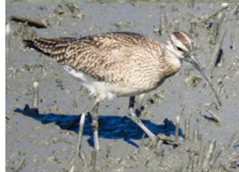
Yellow-crowned Night-Heron and Gray Treefrog at Beidler Swamp. Clapper Rail, Dunlin, and Whimbrel at Pitt Street.

necked Stilts, Dunlins in breeding plumage, and Gull-billed Terns. When the heat became overwhelming, we called it a day, and most of us headed home after a marvelous weekend of birding and fun.