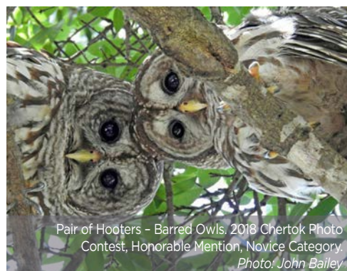
Pair of Hooters - Barred Owls. 2018 Chertok Photo Contest, Honorable Mention, Novice Category.