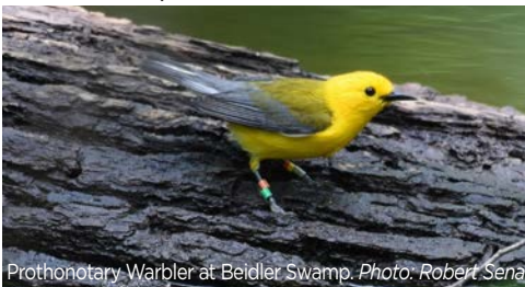
Prothonotary Warbler at Beidler Swamp.