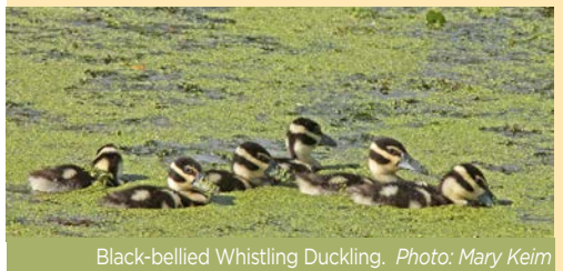
Black-bellied Whistling Duckling.