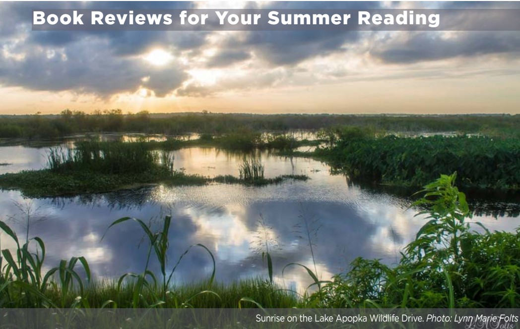
Sunrise on the Lake Apopka Wildlife Drive.