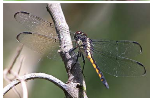
Dragonfly Field Trip at Orlando Wetlands Park, May 2019. Slaty Skimmer, mature male above, female or immature male below.

including assuming the arresting obelisk position with tail pointed toward the sun to minimize solar rays hitting their bodies.