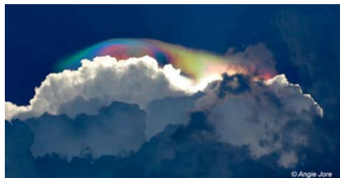
Fire in the Sky – Fire Rainbow (circumhorizontal arc). 2018 Chertok Photo Contest, Honorable Mention, Novice Category.

Environmental science, like any science, requires effort to understand. Conclusions are based on data, and it is useful to understand the way the data was taken. When I taught this subject at community college, I had to build the student's understanding by first introducing what the industrial revolution was and how humankind converted to combustion of fossil fuels, releasing carbon previously in the ground, and how fossil fuel combustion resulted in increasing levels of atmospheric carbon dioxide (CO 2 ). The textbook made clear that natural processes such as respiration and volcanic eruptions also emit CO 2 and that deforestation lessens the planet's uptake of CO 2 , but, by volume, increased combustion of fossil fuels is what has increased atmospheric CO 2 levels worldwide, as country after country has industrialized.