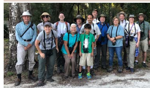
Wekiwa Springs State Park Bird Survey, May 11, 2019.