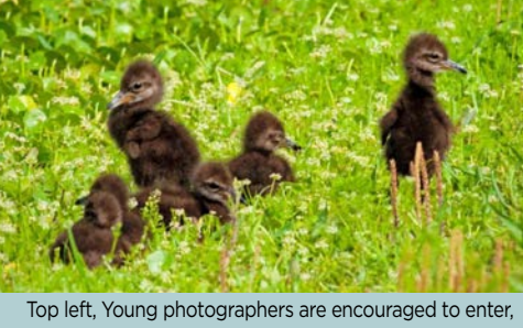
Top left, Young photographers are encouraged to enter, Bottom left, Limpkin Chicks, Youth Honorable Mention Winner, 2010 Chertok Photo Contest, Top right, Eastern Amberwing Dragonfly, Honorable Mention Winner, Novice category, 2015 Chertok Photo Contest, Bottom right, White Pelican, Youth Honorable Mention Winner, 2011 Chertok Photo Contest.