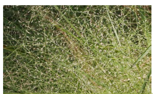
Elliott's Lovegrass at Orlando Wetlands Park.

For texture, color, seed production and groundcover are native grasses. Choose from Basketgrass, Chalky Bluestem, Lopsided Indiangrass, Lovegrasses, and Needlegrasses.