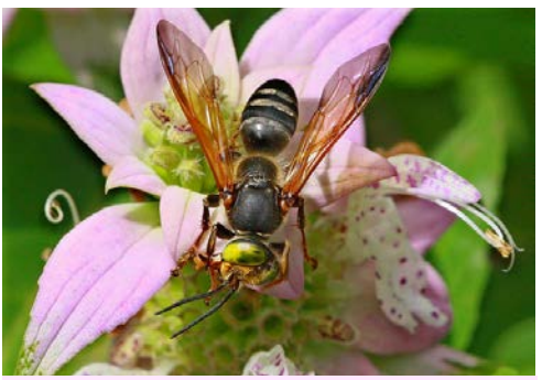
Sand-loving wasp on Spotted Bee balm.