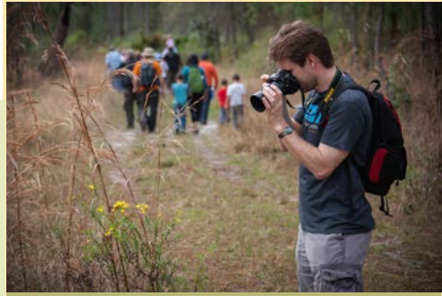
Photographing wildflowers on Chertok Photo Contest-Nature Walk at Isle of Pine Preserve, an Orange County Green PLACE Property.

Deadline is April 18th. Young people up to 17 can enter the Youth Category. See page 8 for details.