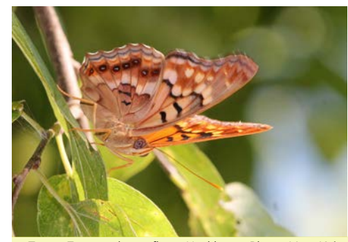
Tawny Emperor butterfly on Hackberry.