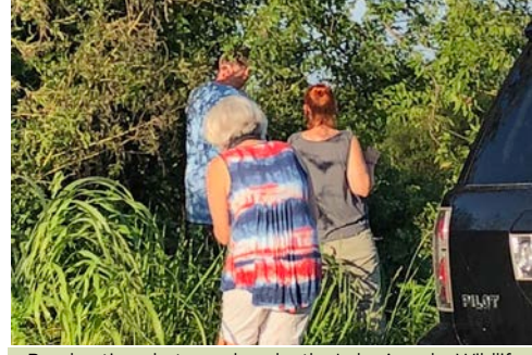
Bug-hunting photographers by the Lake Apopka Wildlife Drive Garden. Photo: Deborah Green

Many wasps and bees visit the native flowers, especially the spotted bee balm, and photographers interested in learning more about insects find it a great place to visit. Deborah Green