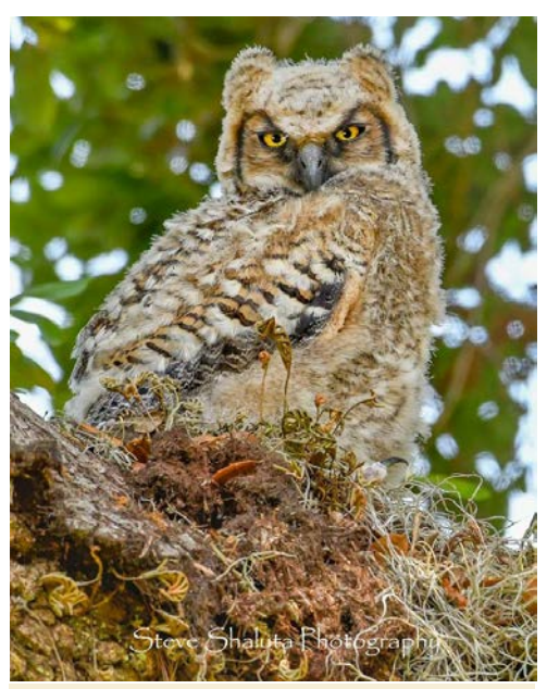
Top left, Great Horned Owlet, returned to Boy Scout-constructed platform, Bottom left, owlet and parent Great Horned Owl. Right, growing owlet