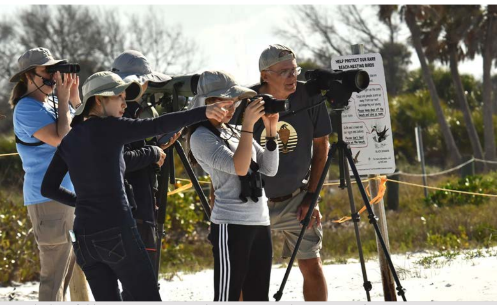
Limited Edition field trip to Fort DeSoto Park, January 2019.

Orange Audubon Society volunteers will again be at Earth Day at Valencia College East Campus on April 5th. We will also be at Siemens Green Fair on April 24th. And we will be at Arbor Day in Belle Isle and at the Apopka Art & Foliage Festival on April 27th. It's a busy month! If you want to help with any of these events, email volunteer@orangeaudubonfl.org.