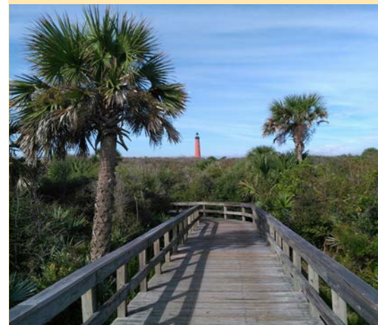
Lighthouse Point Park

Orange Audubon Society's (OAS) Saturday, November 17th field trip will be to Lighthouse Point Park. This Volusia County park in Ponce Inlet has a nice boardwalk where we will look for late migrant songbirds in the hammock, and when we exit onto the well-preserved dunes, we'll observe beach birds. We will bird the Ponce Inlet jetty and mouth of the Halifax River, looking for gulls, terns, shorebirds and wading birds.