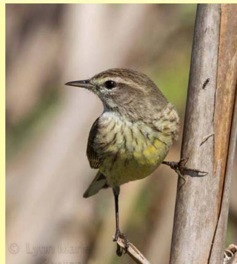
Palm Warbler. February 2017, Lake Apopka Wildlife Drive.

The panther named M34 that biologist Joe Guthrie collared near Sebring traveled 800 miles while he still had his radio transmitter. Landscape level conservation is needed. With Florida Forever dollars still not flowing, the important tool is conservation easements for ranchers, since ranches do provide good habitat. Ranches where the Caloosahatchee River is narrowest (near I-80) are where panthers are most likely to cross.