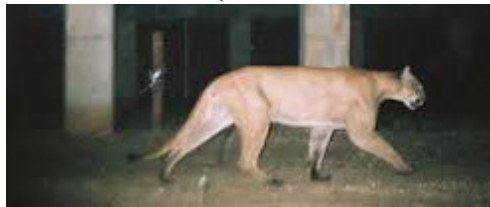
Panther crossing under overpass

Many people see a bobcat and think they've seen a panther, but a panther's tail is longer. Bobcats do get long and leggy, according to Korn, but they only weigh around 25 pounds. Someone always asks her about seeing a black panther. All of the Florida panthers are shades of tan, not black. The