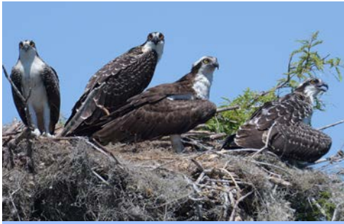
Osprey family on Blue Cypress Lake.

increased in this lake's watershed after the 2007 ban took effect in other areas in 2012.