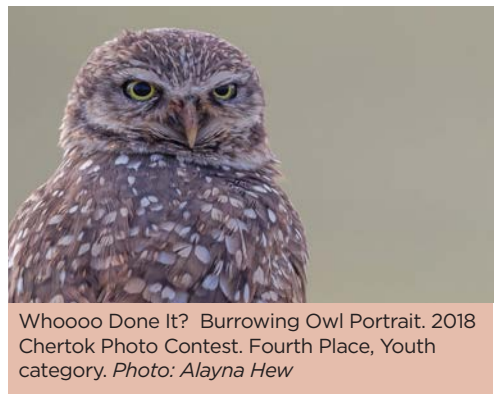
Whooooo Done It? Burrowing Owl Portrait. 2018 Chertok Photo Contest. Fourth Place, Youth category.