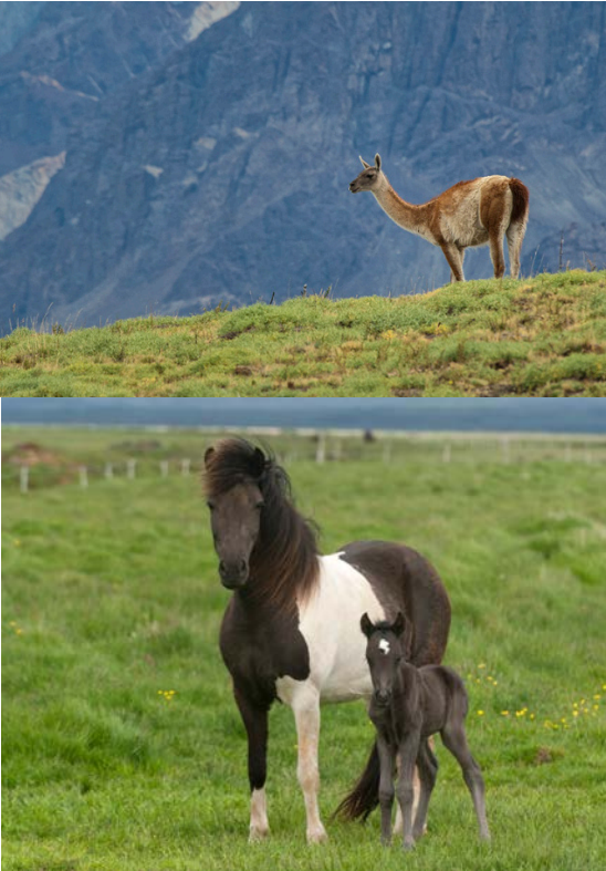
Llama in Patagonia; Ponies in Iceland.