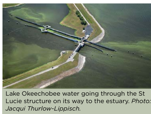
Lake Okeechobee water going through the St. Lucie structure on its way to the estuary.

Finally, in freshwater, there are blooms of a blue-green algae (cyanobacteria) called Microcystis aeruginosa . Blooms are also caused by nutrient pollution, but primarily phosphorus. Microcystis releases a liver toxin (hepatotoxin) called microcystin, which can cause acute poisoning and chronic liver damage. Lake Okeechobee is an ideal habitat for cyanobacteria because it is shallow, sunny, and laden with nutrients from Florida's agriculture.