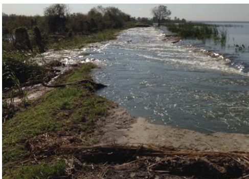
Hurricane Irma's breach of the Loop Trail about 1 mile south of the pumphouse, Sept. 15, 2017. Repairs are underway.