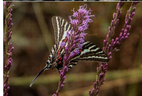
Above, September 23rd Split Oak Forest hike. Below, Zebra swallowtail on Blazing Star.

The main Split Oak trailhead is at 12176 Clapp Simms Duda Road, Orlando. The South Entrance is at 5850 Cyrils Drive, Saint Cloud, with parking along the north shoulder of Cyrils Drive. There are no facilities but there are kiosks with map. Contact Deborah at (407) 637-2525 or sabalpress@mac.com if you have questions. Join us!