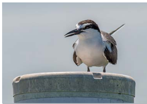
Bridled Tern on Lake Apopka, September 15, 2017.

Several other birders saw what was presumably a different Bridled Tern the day before on Lake Jesup, and closely related Sooty Terns were seen at other locations. Deborah Green