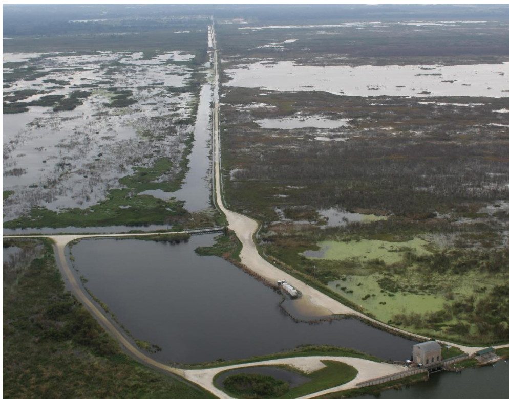
Aerial view (historic pumphouse on Lake Apopka in foreground with pumphouse pond) showing how the entrance road has been flooded from levee breach shown to left. Repairs are underway, and birds are apparently doing well in the wetlands.