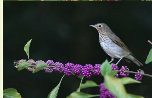
Above, Veery on Firebush. Below, Swainson's Thrush on American Beautyberry.