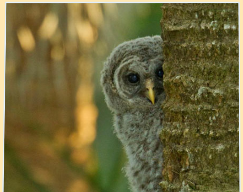
Peek-A-Boo – Barred Owllet. 2014 Chertok Photo Contest Honorable Mention Winner, Advanced category.

Celebrating fall migration, Orange Audubon Society (OAS) is again hosting bird walks at Mead Botanical Garden, 1500 S. Denning Drive, Winter Park. However, the park suffered considerable hurricane damage and as of press time, it is not officially open. We have just learned that the Backyard Biodiversity Event will still be happening on October 14th (p.5), so the Saturday October walks will be able to start that week.