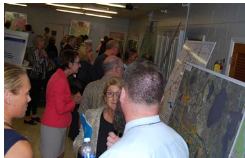
September 26th Concept Studies Public Meeting in St. Cloud.