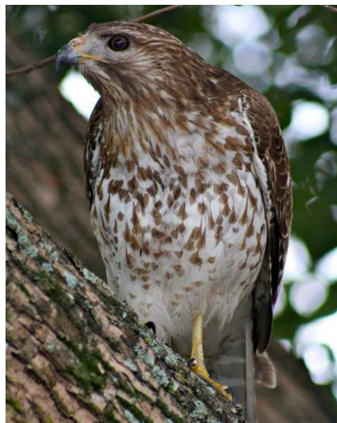
Bird's Eye View (Red-shouldered Hawk). 2010 Chertok Photo Contest Honorable Mention Winner, Youth category.