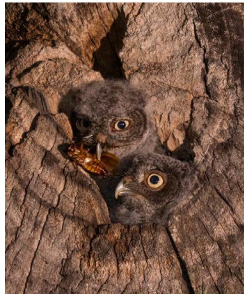
2016 Chertok Photo Contest entry now on display at Colonial Photo and Hobby. Palmetto Bug, It's What's for Dinner - Eastern Screech Owlets.