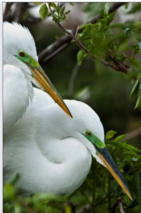
Together - Great Egrets. 2011 Chertok Photo Contest, Honorable Mention, Amateur Category.

the Lake Apopka Wildlife Drive, and an American Redstart at Orlando Wetlands Park (should have been up north). The Yellow-breasted Chat was a life-bird for me and was super exciting!