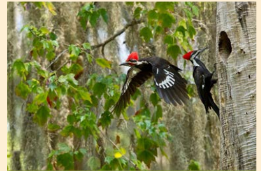
Pileated Woodpecker Male Leaving Nest, Honorable Mention, 2013 Chertok Photo Contest.