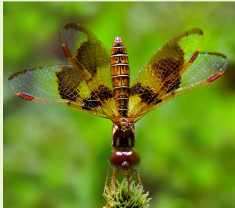
Eastern Amberwing Dragonfly on Broad Scale Yellow-eyed Grass. 2015 Chertok Photo Contest, Honorable Mention, Novice Category.