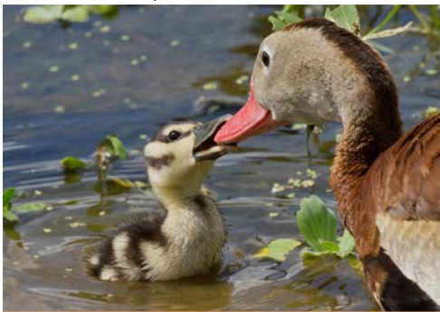
Black-bellied Whistling Ducks. 2016 Chertok Photo Contest entry to be displayed at Colonial Photo and Hobby.