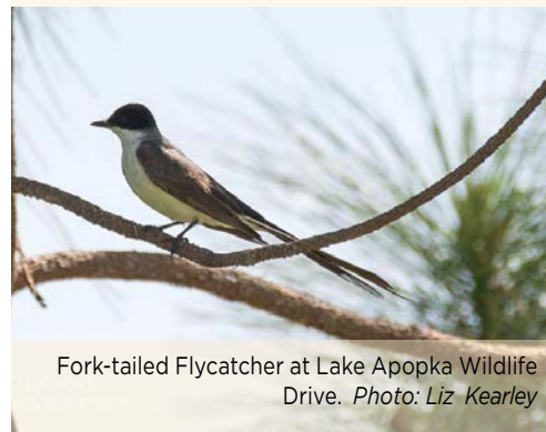
Fork-tailed Flycatcher at Lake Apopka Wildlife Drive.