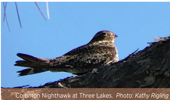
Common Nighthawk at Three Lakes.