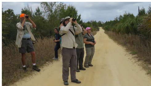
Ocala National Forest Field Trip March 25, 2017.