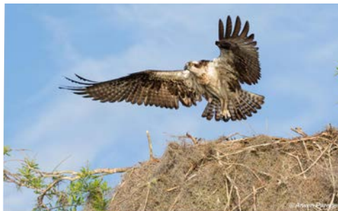
Leaving the Nest - Osprey First Place, 2015 Chertok Photo Contest, Youth Category.