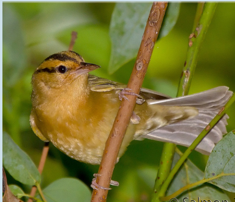
Worm-eating Warbler at Mead Botanical Garden, April 2014.