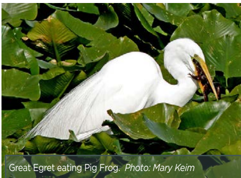
Great Egret eating Pig Frog.