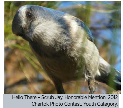
Hello There - Scrub Jay, Honorable Mention, 2012 Chertok Photo Contest, Youth Category.