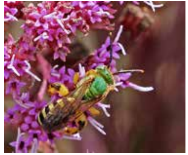
Metallic Green Bee

Beyond Pesticides, a Washington, D.C. nonprofit founded in 1981, will hold its 33rd National Pesticide Forum this year in Florida for the