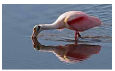
Roseate Spoonbill.