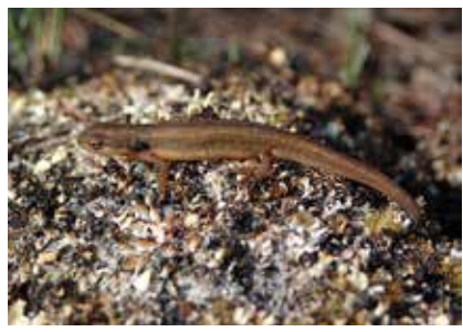
Striped Newt.