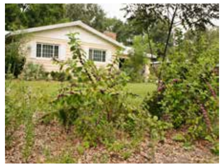
Wildlife friendly landscape

Frequently environmentalists throw up their hands in despair about the state of Central Florida landscapes. Why? Because most are essentially deserts for wildlife. They waste water on environmentallyunfriendly, unadapted (to Florida) plants, use pesticides and fertilizers that leach into water bodies, and require constant, noise-polluting mowing and blowing. Yet some have learned that native, wildlifefriendly plants draw wildlife to their yards providing hours of personal enjoyment while reducing pollution, conserving water and freeing up time once necessary for 'mowing and blowing.'