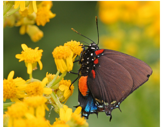
Great Purple Hairstreak