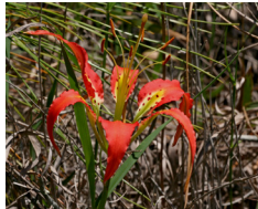
Pine Lily

Orange Audubon Society will visit Pine Lily Preserve in east Orange County on Saturday, September 20, from 8 a.m.–12 p.m. This 431-acre Orange County Green Place property borders Hal Scott Preserve, helping to expand the wildlife corridor in the Econlockhatchee River Basin. The property is named after one of the threatened species found there, Pine Lily or Catesby's Lily ( Lilium catesbaei ).