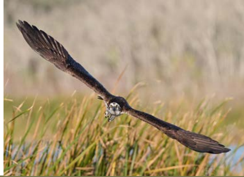
Just Before the Strike—Reddish Egret, 2023 Chertok Photo Contest, Youth 5th Place Winner, Photo: Ethan Landreville; Osprey Increasing Altitude, 2023 Chertok Photo Contest, Novice Honorable Mention Winner, Photo: Jack Berkstresser