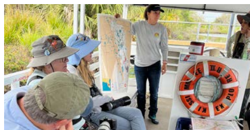
Orange Audubon Society field trip on the Kissimmee River from the Riverwoods Field Station.

The Lake Apopka North Shore wetlands, once part of Lake Apopka, canalized and farmed for 50 years, are now are undergoing restoration as wetlands, and are a wildlife magnet.