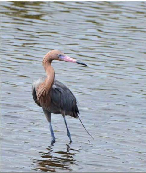
Reddish Egret in breeding plumage, Merritt Island National Wildlife Refuge.