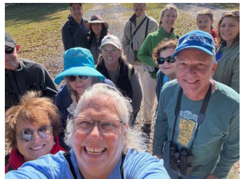
Orange Audubon Society's Green PLACE family photo trip this February to Johns Lake Conservation Area in Winter Garden.

In 2021, the Orange County Board of County Commissioners approved $100 million to expand the Green PLACE Program. Between 2021 and 2023, the County approved 22 new purchase contracts, established a seven-member Green PLACE Advisory Board, and amended administrative regulations for improved oversight.