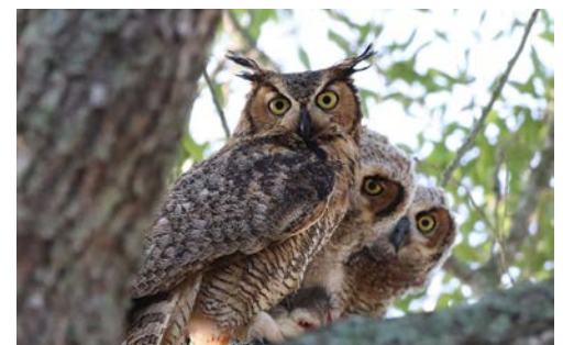
Peekaboo—Great Horned Owls. 2023 Chertok Photo Contest, Novice Category, Honorable Mention Winner

OAS' annual fund-raising auction will be held from June 13, noon-June 24, 2024, 7 PM online . If you have auction questions, call (941) 704-1189. All proceeds will benefit OAS' Nature and Environmental Education Center Fund and educational programs that connect people with nature.