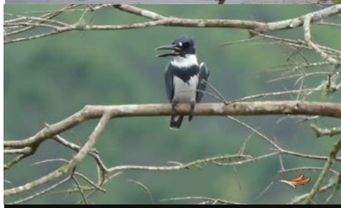
Gilberto orienting the participants about Orlando Wetlands. Photo: Faruk Baghdad , Participants viewing a bird. Photo: Deborah Green . Roseate Spoonbills. Photo: Faruk Baghdad . Belted Kingfisher. Photo: Delsy Rodriguez