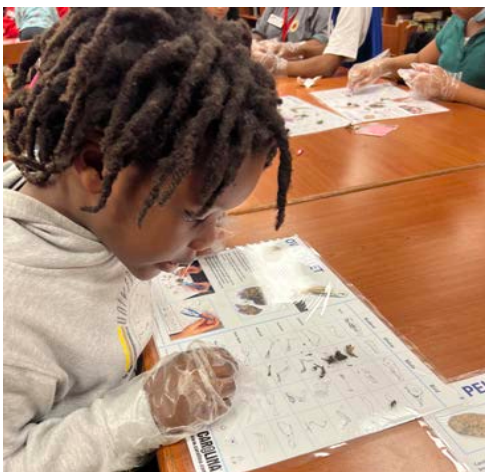
Eccleston Elementary afterschool birding club working reconstructing an owl's prey from the bones in an owl pellet.

Other programs this month included a state birds program at Dommerich Elementary and a wetlands birds program at Orlando Wetlands for the Forest Friends homeschool group.