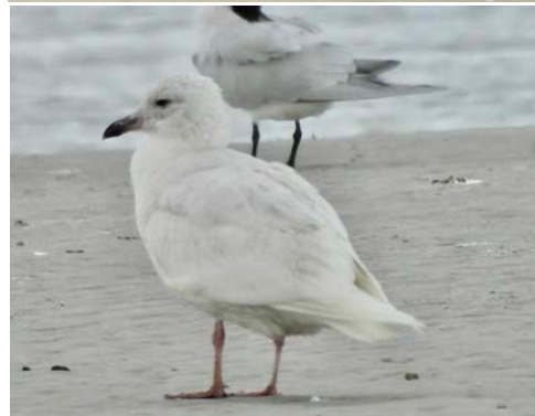
Marine Discovery Center’s boat unloading at Disappearing Island. Birding on the island. Photos: Deborah Green . Iceland Gull, a lifer for most participants. Photo: Kathy Rigling