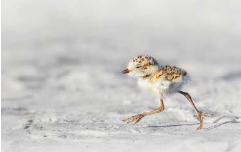
Above, Black-necked Stilt Afterglow. 2013 Chertok Florida Native Nature Photo Contest. Second Place, Advanced Category.