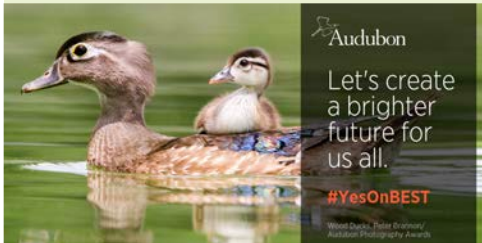
Wood Duck female and duckling.

On October 10, 2019, National Audubon Society released Survival by Degrees: 389 Bird Species on the Brink , an in-depth report shedding light on how 389 out of 604 North American bird species are being adversely affected by climate change.