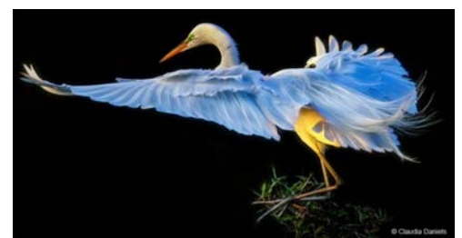
Golden Hour—Great Egret. 2020 Chertok Florida Native Nature Photo Contest. First Place, Advanced Category.