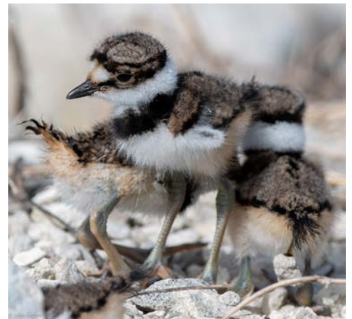
Photos left column and above: Killdeer on nest at the Lake Apopka Wildlife Drive and with three chicks hatched.

go (well, almost all) with one adult in front, three chicks in the middle, and the other adult bringing up the rear.