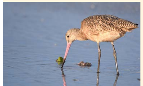
Marbled Godwit at Fort DeSoto Park.