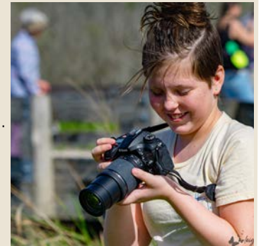
Young photographer.