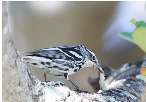
Black-and-White Warbler with caterpillar.