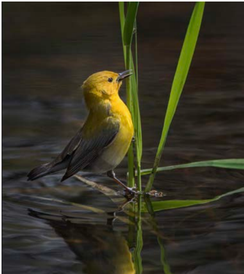
Prothonotary Warbler.

To kickoff the upcoming 2021 Chertok Florida Native Nature Photo Contest, Orange Audubon invited professional photographer Lisa Langell to discuss the elements she teaches her students to improve their photographic images. She described the following six elements: