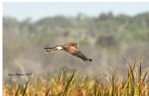
Northern Harrier.

Our field trip leaders made sure everyone was engaged. When field trips are designed around younger audiences, trip leaders share their passion for the outdoors and their excitement becomes contagious. We all stared transfixed by two Northern Harriers hovering over the tall grasses off the North Shore.