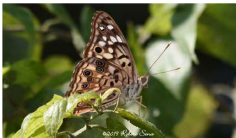
Hackberry Emperor. pollinators.

Red Maple ( Acer rubrum ) – maples support insect-eating birds; fruit for birds and mammals; early nectar for