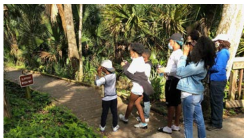
Beginning Birding field trip at the North Shore Birding Festival.

Registrants numbered approximately 200, down from 300 last year, but expected considering trips were limited to 10 participants and quite respectable. With only six weeks from